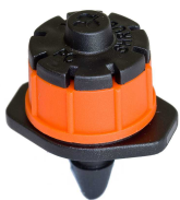
Shrubbler® 360° PC Barb 4 mm