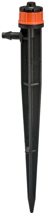
Shrubbler® 360° PC Spike Inlet 4 mm