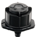
Mini Bubbler Thread 4 mm