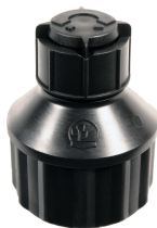
Mini Bubbler Thread 1/2" Female