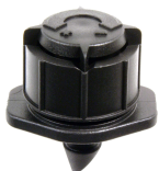
Mini Bubbler Barb 4 mm