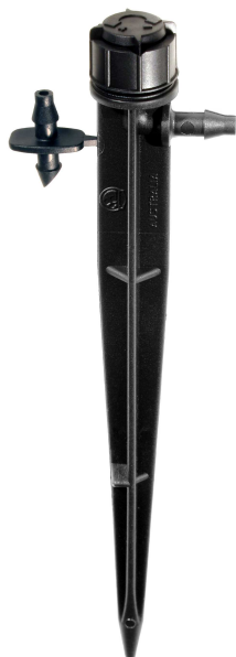
Mini Bubbler Spike Inlet 4 mm